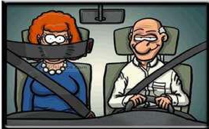
Latest seatbelt technology